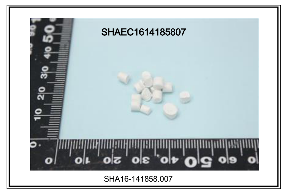
SGS authenticate the photo on original report only