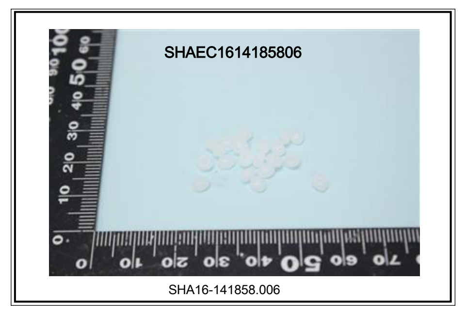
SGS authenticate the photo on original report only